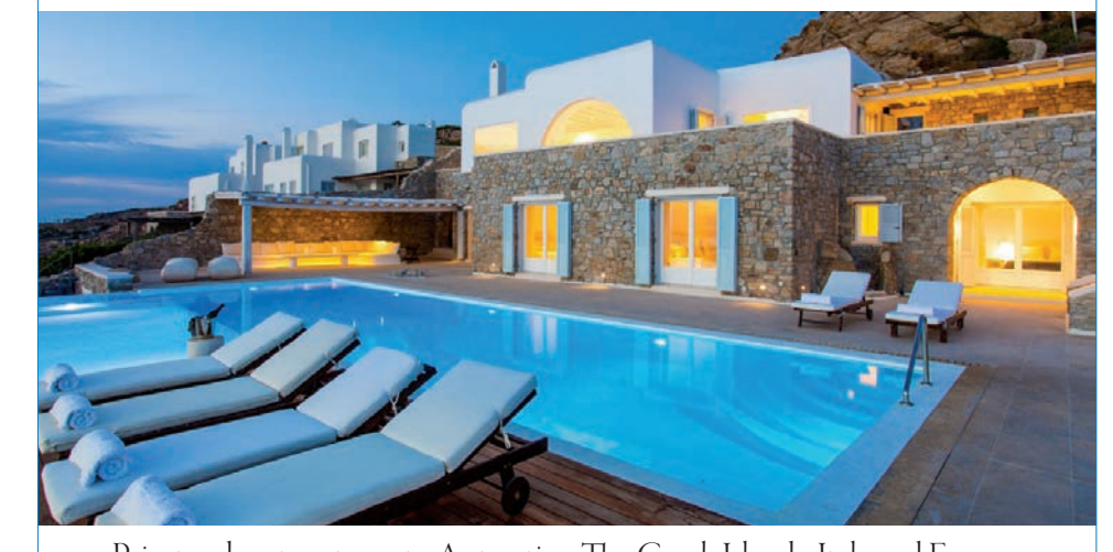
Private adventure tours to Antarctica, The Greek Islands, Italy and Europe