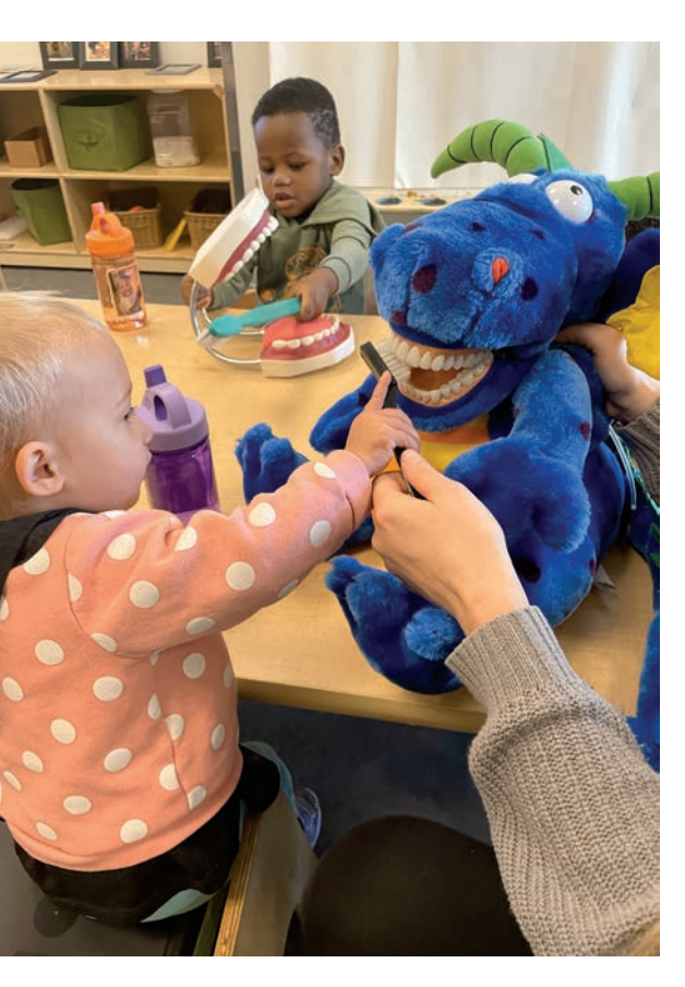
Above: CVHS "Tooth Tutor" visiting the King Street Center Early Head Start classroom. Right: Outside time at the King Street Center. Bottom right: The CVHS Family Connections Program in Burlington.

"It's just such a phenomenal group of people all in the same mission of caring for children and families and our community and making the world a better place."