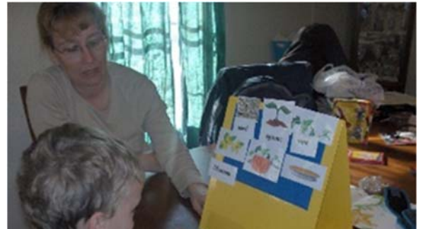
Head Start parent and child learning together on a home visit

During the COVID-19 pandemic, all home visits will be held via computer and/or telephone. Talk with your home visitor or family support specialist if you have concerns about accessing technology.