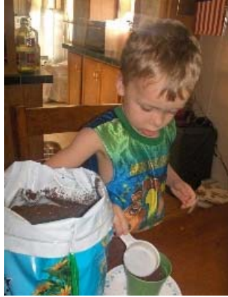
Head Start child planting a garden

may be spread out during the week to include a weekly check in and family video visit. If you or the home visitor cannot participate in a home visit, we will work together to set up a new visit.