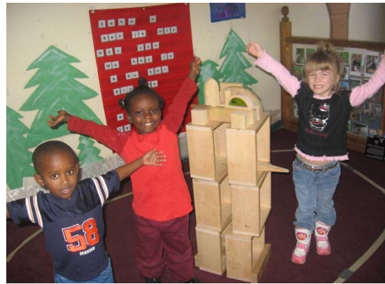
Head Start children building with blocks

Champlain Valley Head Start provides activities to help kids develop in all of these areas. Your child will have fun and learn new skills at the same time.