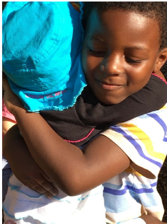
Head Start hug!