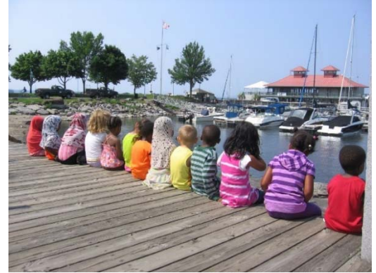
Head Start children overlooking the bay

Champlain Valley Head Start offers you a high-quality program, but sometimes you may have concerns. It might be about the visits or maybe about someone who works with your child. Talk to your Head Start Home Visitor first. Also, you can contact the County Supervisor for your program. The Champlain Valley Head Start Director and Area Coordinators (health, education, family services, mental health, disabilities, and enrollment) can also help you. Please call us with any questions, 1-800-854-9648.